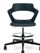
Light task stool.