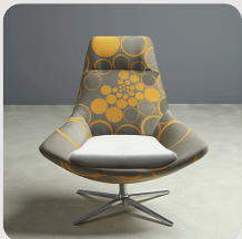
Soft seating chair #930