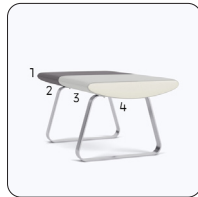
Five-tone (5 textiles) #976 model