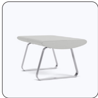
Single (1) textile All models