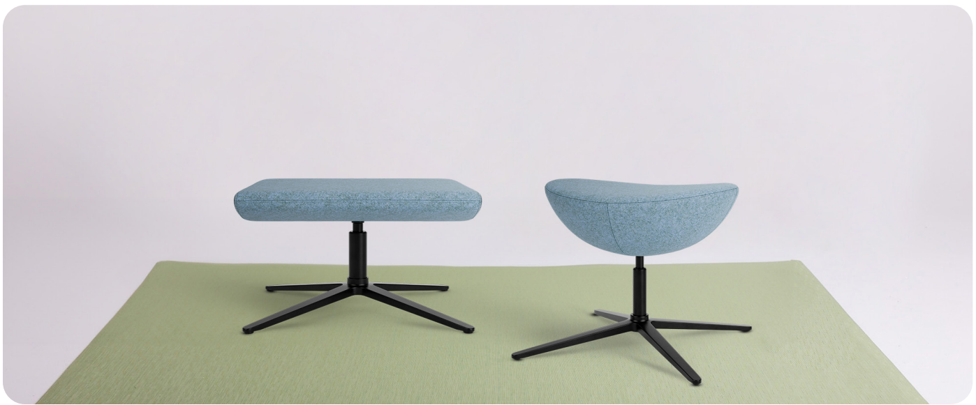
Chico ottoman #955