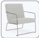
Parallel stitch soft seating chair #938