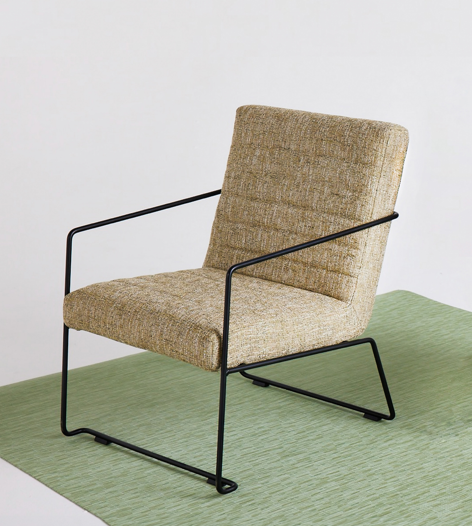
Muir design by Studio V