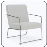
Seamless soft seating chair #937