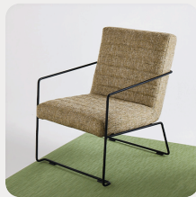
Parallel stitch soft seating chair #938