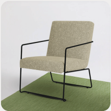
Seamless soft seating chair #937