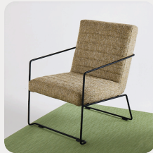
Parallel stitch puffy chair #938