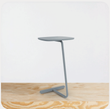
Side table #991