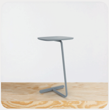
Side table #991