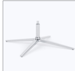
33POL Polished 4-leg fixed metal base