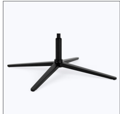
33BLK Matte black 4-leg fixed metal base