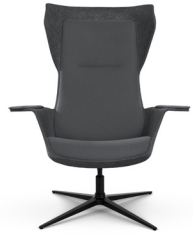
High back #258 Lounge chair with upholstered wing arms & headrest