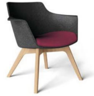
Mid back #275 Lounge or conference chair with wing arms