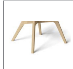
6BEE Beech 4-leg wood base (mid back only)