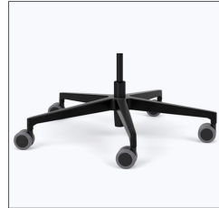
18BB Matte black 5-star swivel base (mid back only)