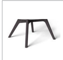
6BLK Matte black 4-leg wood base (mid back only)