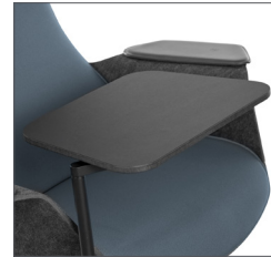
7TABB Optional black arm tablet