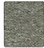
Faux Felt Graphite