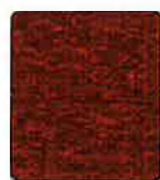
Faux Felt Vibrant