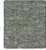
Faux Felt Stone