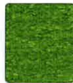
Faux Felt Sprout