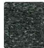
Faux Felt Flannel