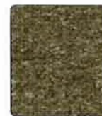
Faux Felt Path