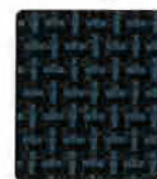
QS Solitaire Midnight