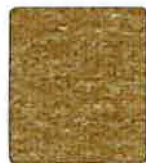
Faux Felt Camel