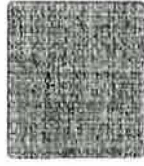
QS Flock Flannel