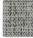
QS Hobnob Ash