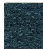
Faux Felt Quail