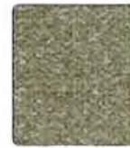
Faux Felt Pebble