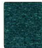
Faux Felt Pool